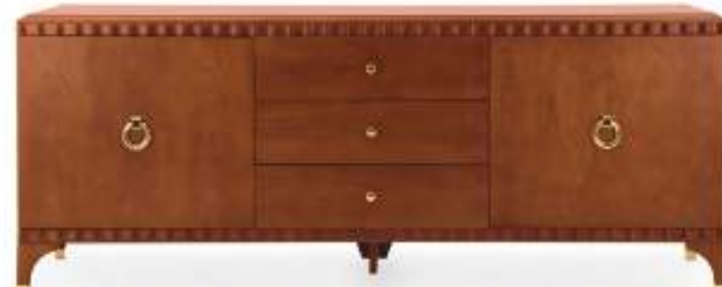
2 DOORS SIDEBOARD WITH DRAWERS

Art. 00CO351 Finish: O6 - English mahogany - cat. ZB Standard: metal tip legs included W. 228 D. 53 H. 96