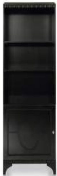
LEFT OPENING BOOKCASE

Finish: MC - Modern cherry - Cat. ZE Standard: Extensions 2 x 50 cm included Metal tips leg: Gold plated W. 222 D. 112 H. 78