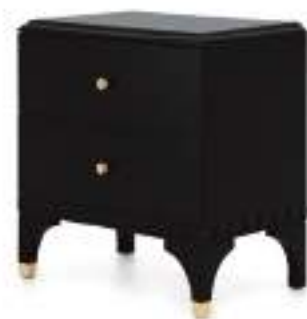
2 DRAWERS NIGHTSTAND

Finishing: P3 - Moka - Cat. ZA Upholstery: Combination H69 - Cat. B Optional: Quilted design on the headboard not included Standard: metal tip legs included Note: Mattress sizes 180 x 200 W. 193 D. 216 H. 145