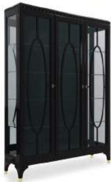
3 DOORS GLASS CUPBOARD

Finish: WE - Wengé - Cat. ZE Standard: Metal tips leg W. 111 D. 42 H. 221