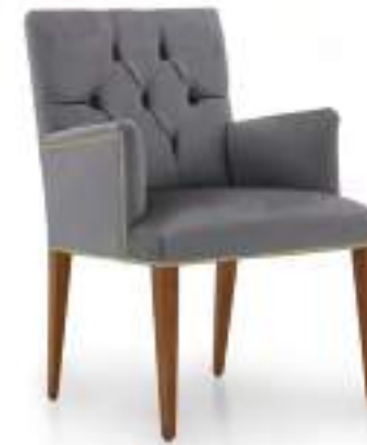
ARIANNA SMALL ARMCHAIR