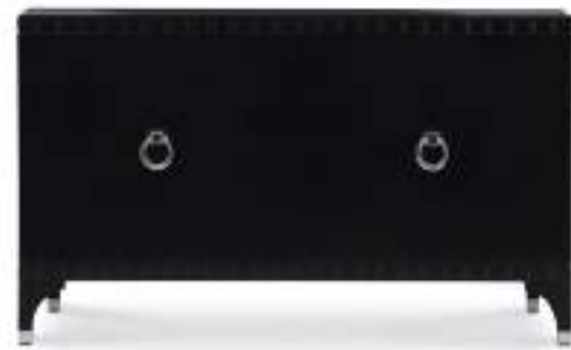
2 DOORS SIDEBOARD

Art. 00CR356 Finish: O6 - English mahogany - cat. ZB Standard: metal tip legs included W. 152 D. 59 H. 91