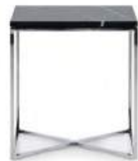
KLEPSIDRA LAMP TABLE

Marble top: Carrara white Metal base: Chrome W. 130 D. 80 H. 40