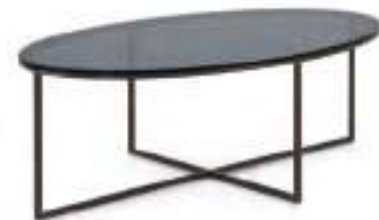
TRIO COFFEE TABLE

Upholstery: Fabric MA2 - Cat. C Standard: Loose cushions #CUS59 included W. 230 D. 100 H. 84