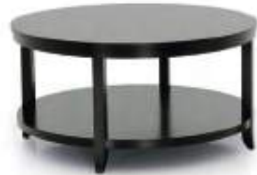
KYLINDO COFFEE TABLE