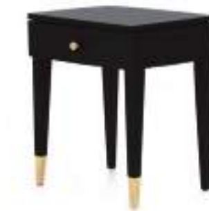
LOOK SINGLE DRAWER NIGHTSTAND

Finish: P3 - Moka - Cat. ZA Upholstery: Fabric LRW - Cat. B Optional: Quilted design on the headboard not included W. 120 D. 9,5 H. 150