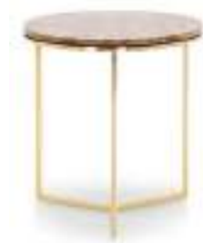
TRIO LAMP TABLE

Finish: P3 - Moka - cat. ZA Upholstery: Fabric ANS - Cat. A Trimming: Self piping Standard: Buttons on the back included W. 230 D. 82 H. 80 SH. 51 AH. 80