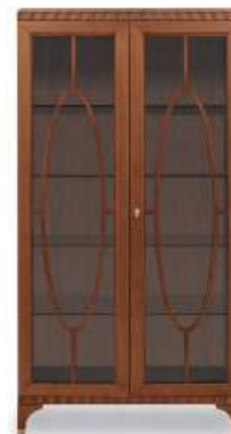
2 DOOR GLASS CASE

Art. 00CO352 Finish: MC - Modern cherry - cat. ZE Standard: metal tip legs included W. 228 D. 53 H. 91