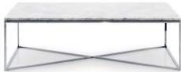
KLEPSIDRA COFFEE TABLE

Finish: MC - Modern cherry - Cat. ZE Upholstery: Fabric LF6 - Cat. B Trimmings: Self piping Standard: Buttons on the back included W. 200 D. 84 H. 80