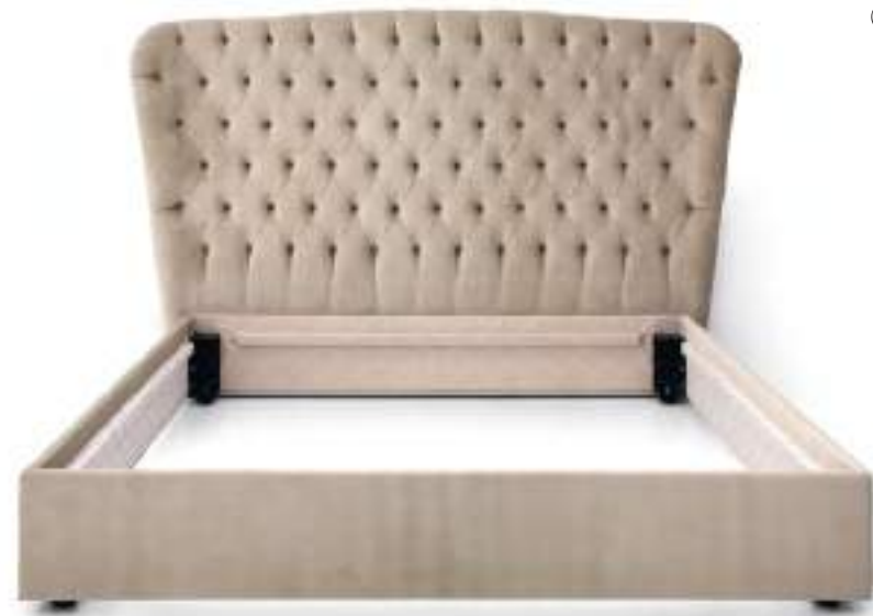
FOLD DOUBLE BED