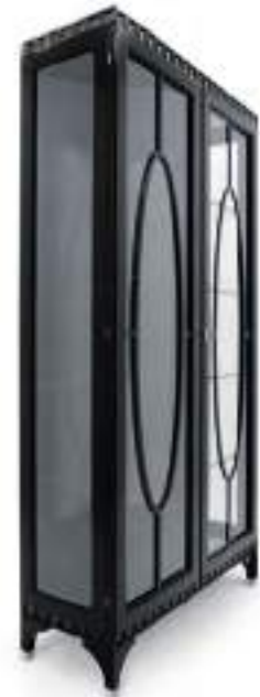
2 DOORS GLASS CUPBOARD