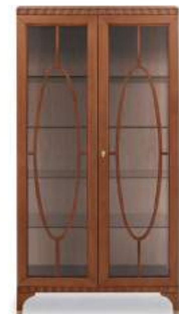
2 DOORS DISPLAY CABINET GLASS SIDE PANELS

Art. 00VE350 Finish: MC - Modern cherry - Cat. ZE Standard: Metal tips leg W. 111 D. 42 H. 221