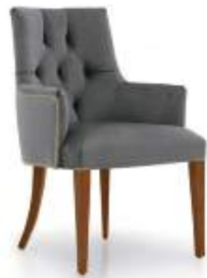
OLIMPIA SMALL ARMCHAIR

Finish: SG - Spring grey - Cat. ZD Upholstery: Fabric BXS - Cat. B Trimmings: J - Silver nails Optional: Chrome tip legs not included W. 49 D. 59 H. 97,5