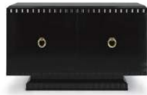
2 DOORS SIDEBOARD

Art. 00CR356 Finish: O6 - English mahogany - cat. ZB Standard: metal tip legs included W. 152 D. 59 H. 91