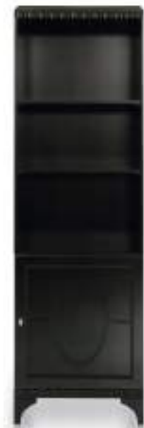
RIGHT OPENING BOOKCASE

Finish: WE - Wengé - Cat. ZE Standard: Metal tips leg W. 70 D. 42 H. 221