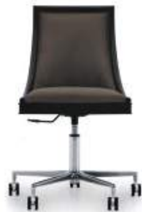
AMINA SWIVEL CHAIR

Finish: WE - Wengé - Cat. ZE Lined inserts: Fabric A8R - Cat. A Metal tips leg: Chrome W. 133,8 D. 72 H. 91,5