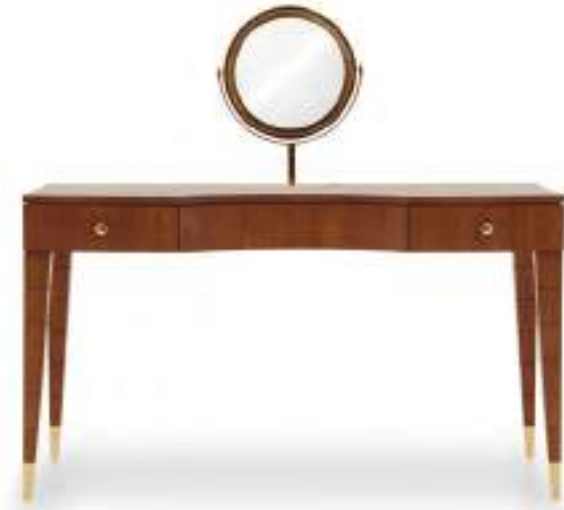
LOOK DRESSING TABLE WITH SWIVEL MIRROR

Finish: MC - Modern cherry - Cat. ZE Metal tips leg: Gold plated W. 140 D. 55 H. 80