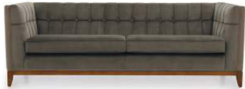
LIXIS 4 SEATER SOFA