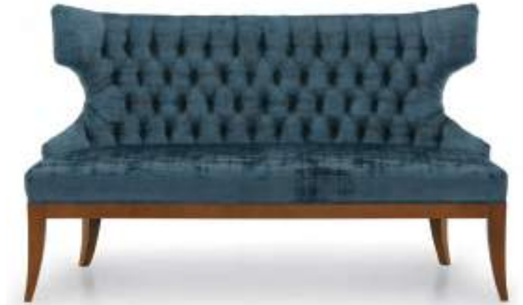
IRENE 2 SEATER SOFA

Finish: MC - Modern cherry - Cat. ZE Upholstery: Fabric LFS - Cat. B Trimmings: Self piping Standard: Tufted back included W. 77 D. 72 H. 86