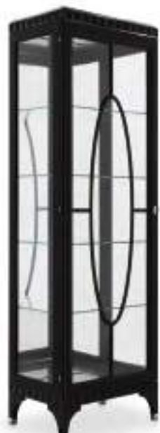
LEFT OPENING GLASS CUPBOARD

Finish: P3 - Moka - cat. ZA Standard: metal tip legs included Optional: mirror back not included W. 167 D. 42 H. 221