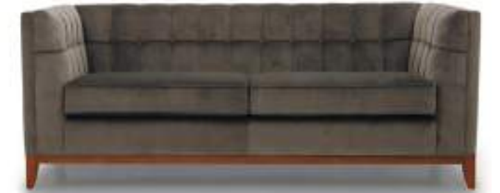
LIXIS 3 SEATER SOFA

Finish: MC - Modern cherry - Cat. ZE Upholstery: Fabric AD3 - Cat. A Trimmings: Self piping Standard: Buttons on the back included W. 95 D. 80 H. 80