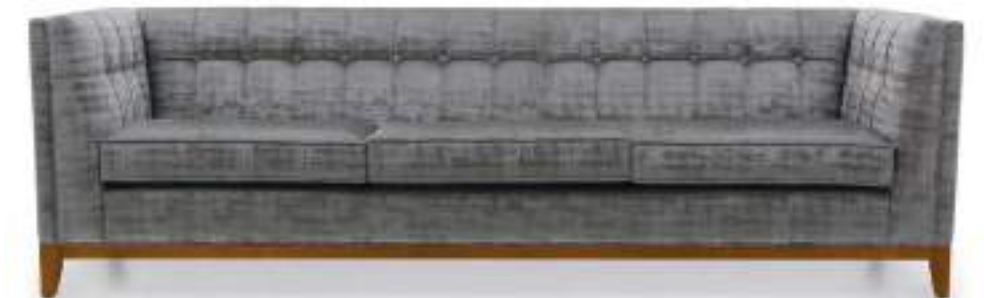
LIXIS 5 SEATER SOFA

Finish: MC - Modern cherry - Cat. ZE Upholstery: Fabric LJJ - Cat. B Trimmings: Self piping W. 96 D. 81 H. 51