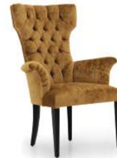
QUEEN SMALL ARMCHAIR

Finish: WE - Wengé - Cat. ZE Upholstery: Fabric DAH - Cat. D Trimmings: F - Shaded nails Standard: Round handle on the back included Optional: Tufted back not included W. 46 D. 56 H. 95