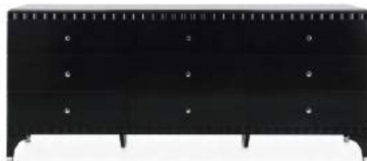
9 DRAWERS SIDEBOARD

Art. 00CR352 Finish: MC - Modern cherry - Cat. ZE W. 220 D. 55 H. 85