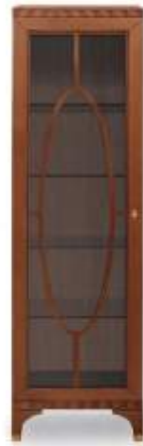
LEFT OPENING GLASS CASE