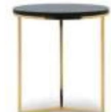
TRIO LAMP TABLE

Marble top: Emperador dark Metal base: Gold plated W. 80 D. 80 H. 41