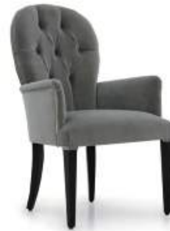
CALIPSO SMALL ARMCHAIR