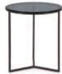
TRIO LAMP TABLE

Finish: MC - Modern cherry - Cat. ZE Upholstery: Combination H49 LF6+AD2 - Cat. B Trimmings: Self piping Standard: Buttons on the back included W. 230 D. 84 H. 80