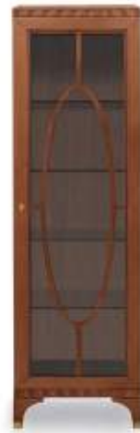
RIGHT OPENING GLASS CASE

Finish: MC - Modern cherry - Cat. ZE Standard: Metal tips leg W. 70 D. 42 H. 221