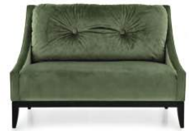
DOROTEA 2 SEATER SOFA

Finish: P3 - Moka - Cat. ZA Upholstery: Fabric M4Z - Cat. C Trimmings: Self piping Standard: Loose cushion included W. 72 D. 85 H. 89