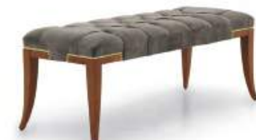
IDRA UPHOLSTERED BENCH

Upholstery: Fabric LJK - Cat. B W. 51 D. 51 H. 50