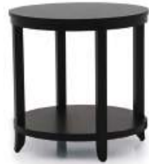
KYLINDO LAMP TABLE

Finish: WE - Wengé - Cat. ZE W. 90 D. 90 H. 45,5