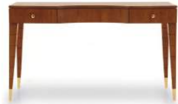
LOOK DRESSING TABLE