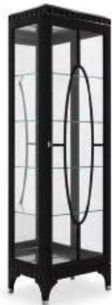
RIGHT OPENING GLASS CUPBOARD

Finish: O6 - English mahogany - cat. ZB Standard: metal tip legs included W. 111 D. 42 H. 221