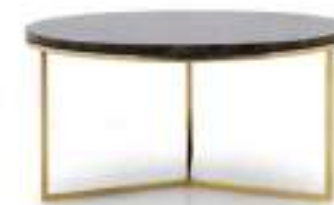
TRIO COFFEE TABLE

Smoked Glass top Metal base: powder coated Giove Brass color - V W. 120 D. 70 H. 40