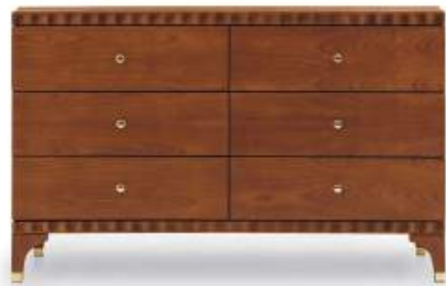
CHEST OF DRAWERS

Finish: P3 - Moka - Cat. ZA Upholstery: Combination H22 L64+L19 - Cat. B Trimmings: Self piping Standard: Buttons on the back included W. 94 D. 97 H. 86